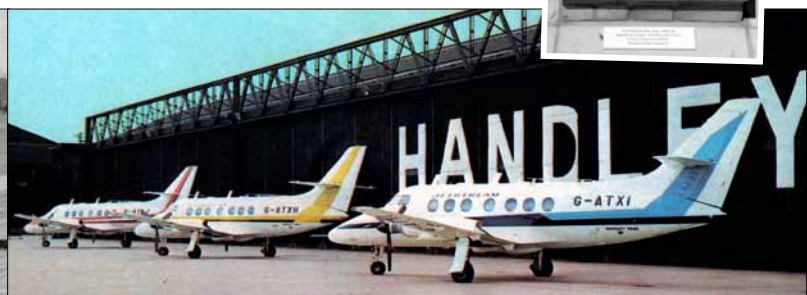
The first three Jetstream prototypes by the Colney Street hangar in 1967.