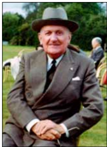
Sir Frederick Handley Page at a garden party in 1960.

The company was founded by Frederick Handley Page (1885-1962) who was knighted in 1942. It had small beginnings and began building its first aircraft in 1908 at Barking. In 1909 it became the first limited company in Britain for the design and manufacture of aircraft.