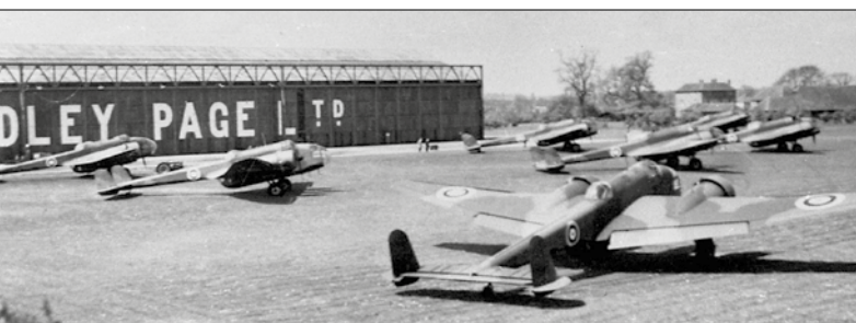
Hampden bombers ready for delivery to the RAF in April 1939. Seen from the railway bridge, Old Parkbury Lane.