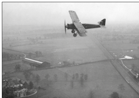
Handley Page HP34 Hare torpedo bomber over the new Radlett aerodrome c.1930. View looking north.