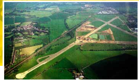
View south over Radlett aerodrome in 1992 with gravel extraction just beginning.

During the early 1930s Handley Page produced the HP42 airliners for Imperial Airways, and the Heyford, the RAF's last biplane heavy bomber. The rearmament of the 1930s saw the Harrow and Hampden medium bombers on the production lines, but the Halifax was