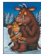
The Gruffalo's Child

Tue 30 The Gruffalo's Child 1.30pm & 4.30pm