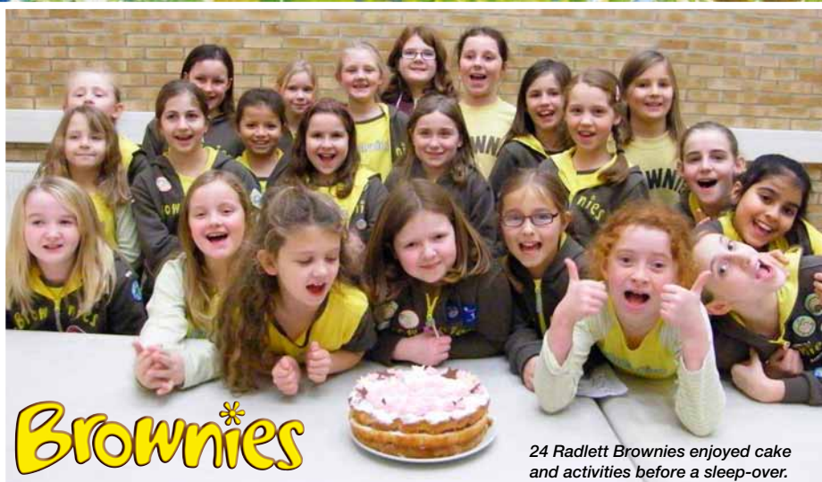
24 Radlett Brownies enjoyed cake and activities before a sleep-over.

On Thursday night 2 January, 24 Brownies slept in Christ Church, Watling Street. Before settling down