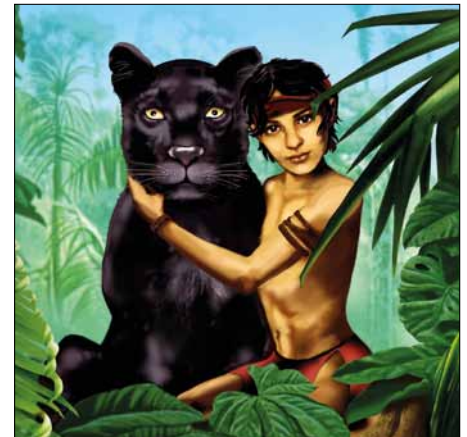
Jungle Book - 16 April at 11am and 2pm

www.radlettcentre.co.uk www.radlettcentre.co.uk www.radlettcentre.co.uk