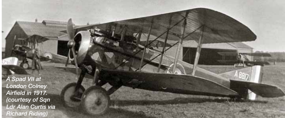
A Spad VII at London Colney Airfield in 1917.