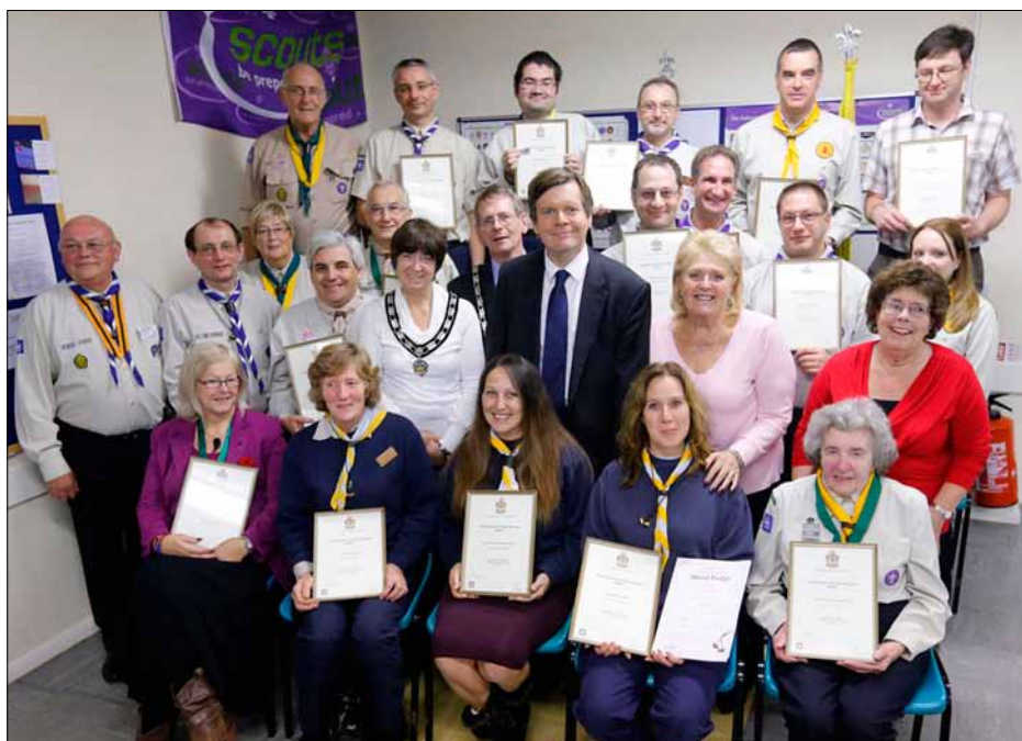
Leaders from 1st Radlett Scout Group (all in front row) were presented with their long service at an Elstree Scout District awards evening.