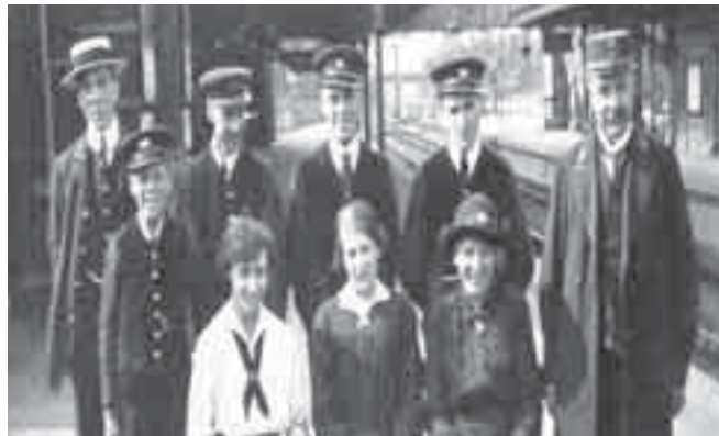
The Radlett Station Staff in 1917

The Victorians, who did a very good job in terms of planning