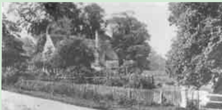
Kemprow c1910. The medieval gallows erected jointly by the Abbots of Westminster and St Albans were near this site. Note The coal-duty marker post denoting the then Parish boundary and the point at which duty on coal brought into the London area becoming payable.

High Cross was so named in 1256 when the gallows were erected. These were used for about 200 years. About 500 years ago an area of land called Kempys Croft occupied the triangle from Kemprow to High Cross and along part of Radlett Road. This covered about two acres and is mentioned in the Court Roll of 1526. This land was developed soon after 1893 when land changed ownership.