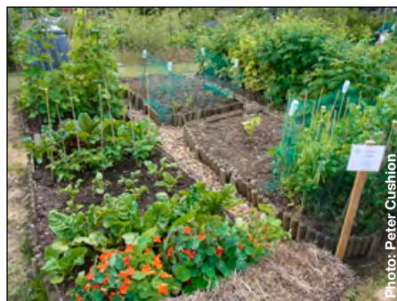
Liz Bissett's winning mini allotment.