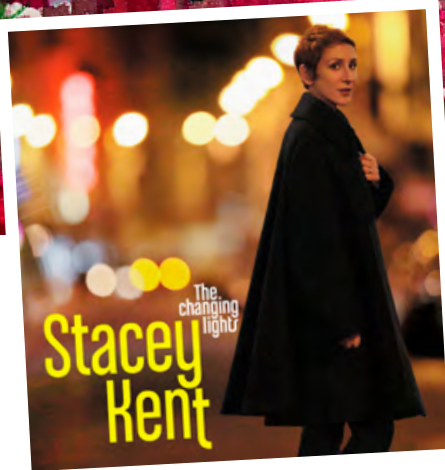
American Grammy-nominated singer Stacey Kent makes a welcome return to Radlett on Sunday 27 September.