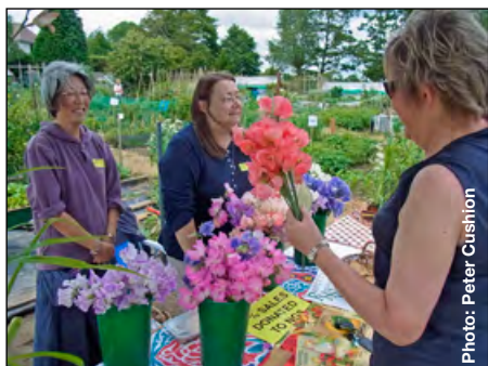
Sweet peas on sale.