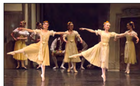
With colourful costumes, lively characters and beautiful music from Delibes, Coppélia is the captivating story of an eccentric toymaker and his beloved doll. On Saturday 3 October.