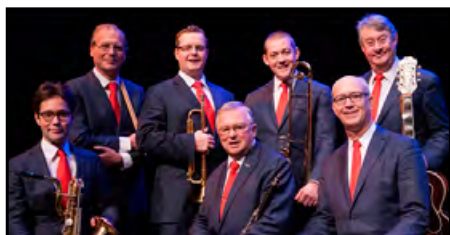
Officially launched on D-Day, 5 May 1945, the current line-up of the Dutch College Swing Band come to Radlett on Wednesday 9 September.