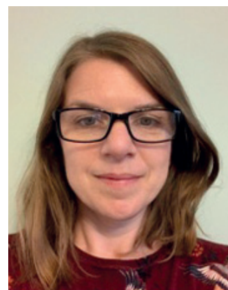
Chairman of Access for All Working Party