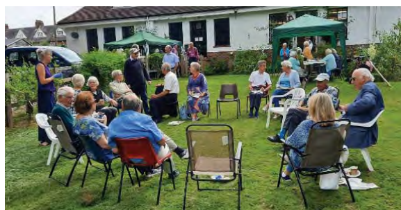
A few of the guests enjoying last year's party.

For the third year running the Museum will be offering its popular Cream Tea Party on the afternoon of Sunday 16th July in the Radlett Village Institute and outside in the garden if the weather is good. Sandwiches, cakes, scones and tea and coffee will be provided. The Museum will also be open. Put the date in your calendar and prepare to indulge yourself for one afternoon! Full details will be provided on our website nearer the time.