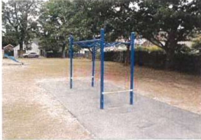
3. Monkey Bars