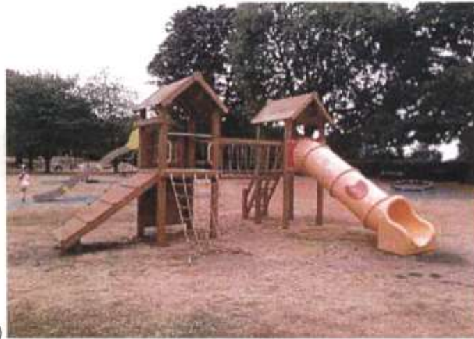
4. Multi Play Unit (Timber)

Brief for Play Equipment Tender V1 – June23