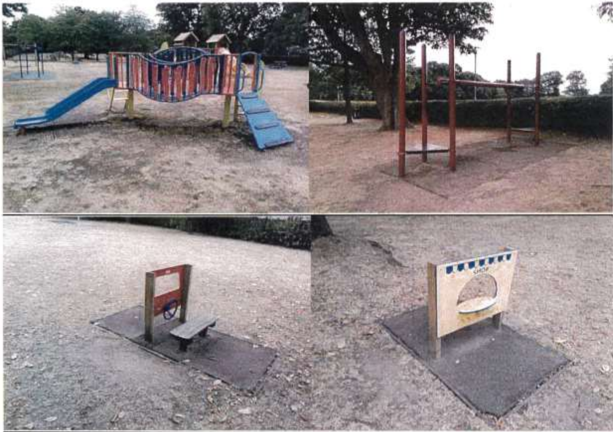
Brief for Play Equipment Tender V1 – June23