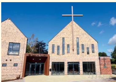
St John's Church, Gills Hill Lane

St John's Church has always aimed to serve the local community and, with this new facility, we are keen to explore new ways of doing so.