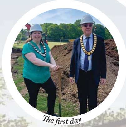
The first day

Well, it's finally here! Aldenham Parish Council's (APC) most ambitious project since it collaborated with Hertsmere Borough Council to build the Radlett Centre nearly thirty years ago. Phillie's Café opened its doors to serve the community at the end of October.