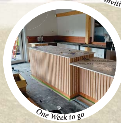
One Week to go