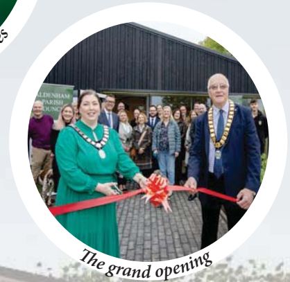
The grand opening

rec in a sheltered and welcoming environment.